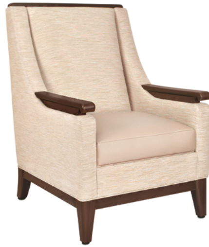
Model: LI1111 28W 32D 42H 21.5SW 19SD 19SH 25AH

Smaller scaled dimensions make the Lita chair the perfect seating option for petite residents. The raised arm caps facilitate ingress and egress for those with limited mobility, providing a sturdy surface and a hand grip. The back cap adds a design feature that protects the fabric and keeps it clean